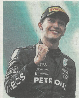
▲ George Russell's win in Austria was the second of his F1 career

"If I had the choice, Silverstone would always be No 1 of a race win, of course," he says. "When you go to your home race you feel this extra energy from the crowd, you're just sort of riding this wave."